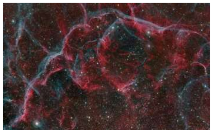
About 11,000 years ago, a star exploded in the constellation Vela the Sails. This photo shows the northern portion of the remnant, as well as the pulsar that the stellar progenitor left behind.

While interstellar dust may be thinly spread, it also tends to clump together, even forming dense clouds. Some of these clouds are so thick that the Incas of South America made them into constellations. Among the closest are the Taurus-Auriga clouds, which are only a thousand light-years away, allowing us to study them in great detail.