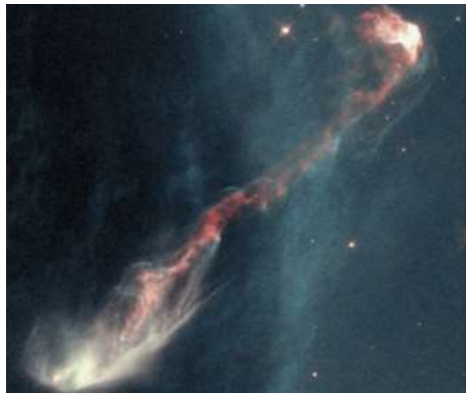
A 3-trillion-mile (4.8 trillion km) jet from a young star (invisible inside dust at the lower left of the image) forms Herbig-Haro object HH-47. The sinuous glow is caused when the powerful jet meets the interstellar gas and dust.

Once formed, the star remains stable as it consumes its hydrogen fuel. Seventy percent of the Sun's nuclear energy is supplied by the proton-proton (pp) chain, whereby four protons join in a three-step process to make helium, with the ejection of protons, gamma rays, and neutrinos (near-massless particles that carry energy at nearly the speed of light). The other 30 percent comes from the carbon cycle, in which carbon and hydrogen combine to create a chain of six reactions that generate nitrogen, oxygen, and ultimately ends with carbon and helium, the former of which allows the cycle to begin again. This also produces gamma rays and neutrinos, as well as positrons (positively charged electrons).