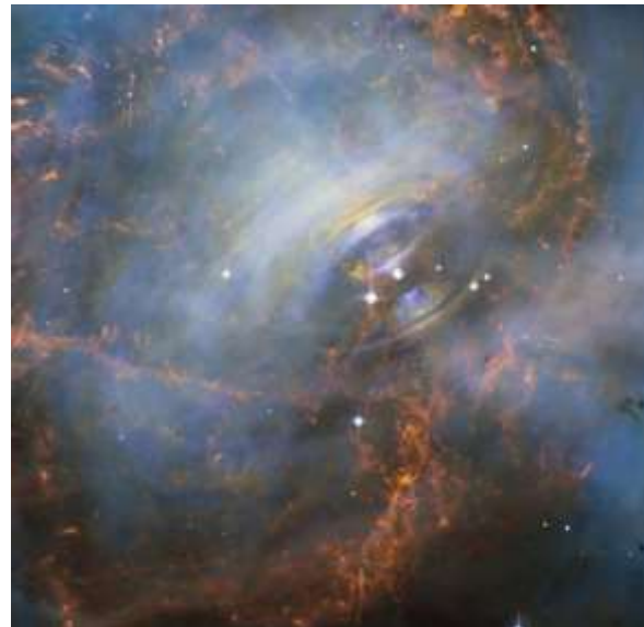
Deep within the Crab Nebula (M1) supernova remnant is its beating heart: the pulsar left behind when its massive progenitor star finally ceased nuclear fusion and collapsed. The pulsar itself is the rightmost of the two brighter stars at the center of the image. Eventually, the nebula itself will drift away into space, seeding future generations of stars.

While the clouds are filled with T Tauri stars, none of these stars is visible to the naked eye. Moving outward perpendicular to the disk, the jets hammer the surrounding interstellar gas into bright shock waves, which are common phenomena both on Earth and in the universe in general. A shock wave is formed in a fluid when a body moves faster than the natural speed of the wave within it, as with the bow-wave off the prow of a speedboat. Here, this violent meeting results