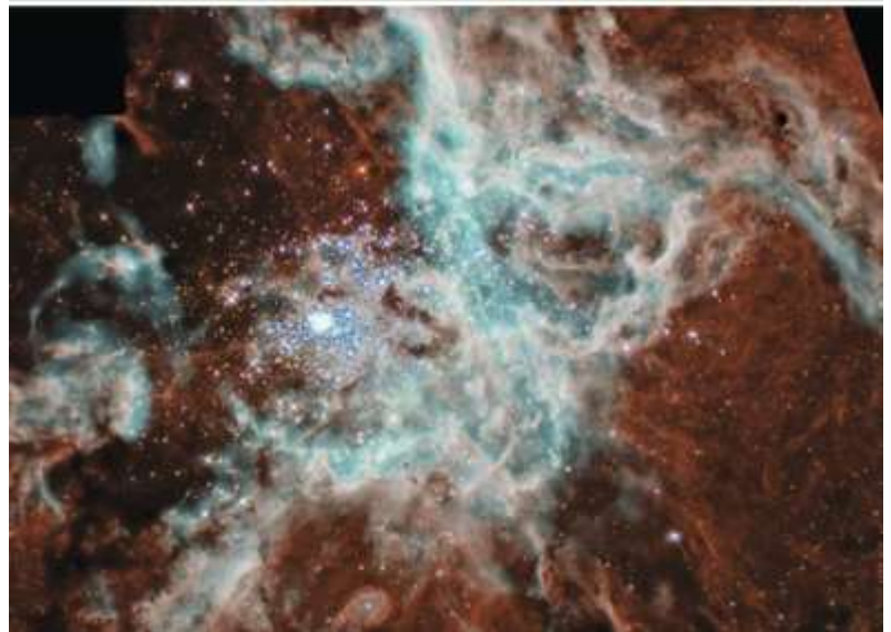
Thousands of stars are igniting within the vast 30 Doradus Nebula, located in the Milky Way's largest satellite galaxy, the Large Magellanic Cloud.

We live in a relatively quiet district of a galaxy 100,000 light-years across that contains around 200 billion stars arranged in a disk beset with spiral arms. As galaxies go, it's pretty big, though the supermassive black hole at the center is relatively small, just 4 million solar masses. There is ample evidence from the Milky Way's rotation that our galaxy, like all others, contains considerable dark matter, whose role in star formation eludes us. But many of the processes of stellar evolution have become apparent, most notably that through death comes life. Stellar evolution is cyclic, with new stars replacing those that pass away.