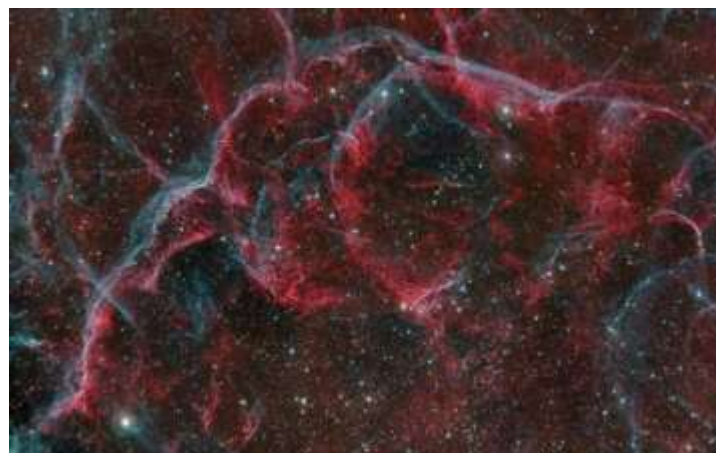
About 11,000 years ago, a star exploded in the constellation Vela the Sails. This photo shows the northern portion of the remnant, as well as the pulsar that the stellar progenitor left behind. (Harel Boren)

While interstellar dust may be thinly spread, it also tends to clump together, even forming dense clouds. Some of these clouds are so thick that the Incas of South America made them into constellations. Among the closest are the Taurus-Auriga clouds, which are only a thousand light-years away, allowing us to study them in great detail. Opaque clouds of interstellar dust keep out heat radiated by nearby stars, and the gas within the dark clouds falls