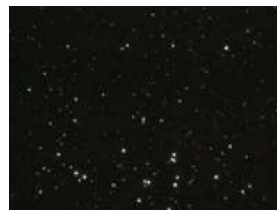
The young stars of the Beehive Cluster (M44) will slowly move apart over time. This 600-million year-old open cluster may be what our own Sun's birth cluster looked like before it dispersed.