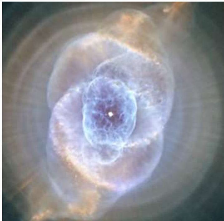
NGC 6543 are planetary nebulae that develop as Sun-like stars slough off their outer layers in the later stages of their lives. When light from the dying star at the center of the debris field hits this gas and dust, the material glows, creating ethereal shapes.

The luminosities of dwarf stars are critically dependent on mass. At the low end, stars run entirely on the pp chain, their cool reddish surfaces radiating at rates less than 1/1,000 that of the Sun. At the high end, they employ the carbon cycle and shine with the light of more than a million Suns, allowing them to be visible in other galaxies. Their brilliance and winds are so powerful that they shred the local interstellar gas and dust, creating blobs that can contract and form new stars, continuing a steady cycle of birth and death that created our own Sun and its planets.