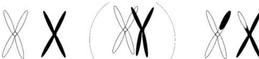
Traits & Genes Unit, Packet 4

Score this response (1,2,3) - Complete: Accurate: Precise: Overall: